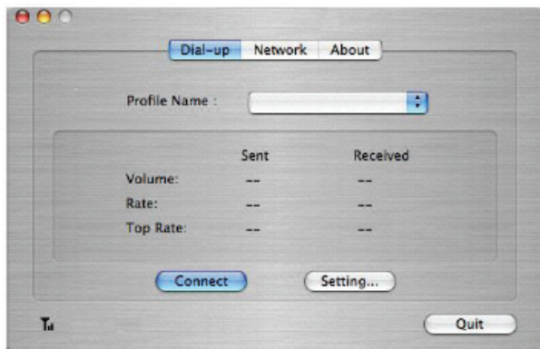
Figure 2-1 Optus Wireless Broadband interface